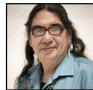
Delaware Nation at Moraviantown, Ontario, Canada