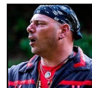
Lenape Nation of Pennsylvania